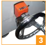
3 Analog counters simplify changeover