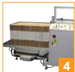
4 48" powered hopper holds up to 150 cases