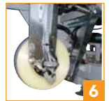
6 Low tape/no tape motion sensors