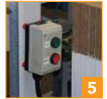
5 Powered hopper lift