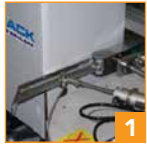
1 Pneumatic arm squares cases before sealing