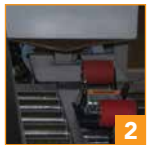
2 All 4 flaps folded pneumatically