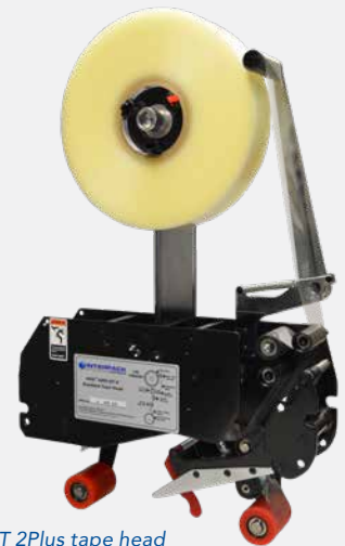
ET 2Plus tape head

These vertical format case erectors offer an expanded range of case sizes versus horizontal format erectors. Their compact footprints conserve floor space while improving productivity.