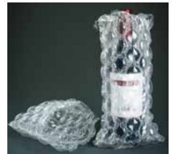
Shown: Glass bottle inside inflated pouch