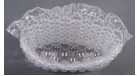
Shown: Inside view of inflated pouch